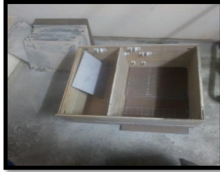
Figure 2: Uniform mortar tile